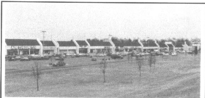
View of Mall from Shawnee Street (Hwy 62)